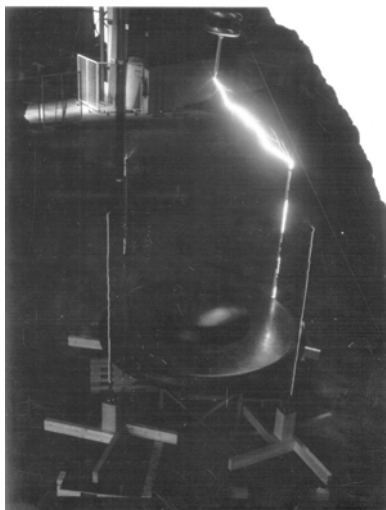
Figure 3 : LEMP tests. We can observe the sparkover along the lightning diverter strips

The 5 MV generator was one more time use for these tests and the current injected in one of the rods was around 5 kA. Values of voltage as high as 840 volts were found on a 10 k \Omega resistance. It was then decided to study a protection scheme based on all the measurements made.