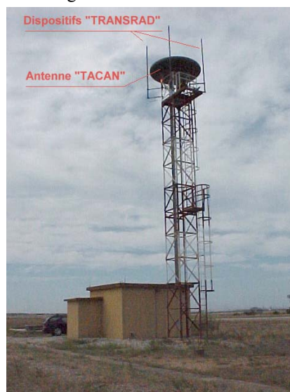
Figure 3 : Testing in field

After each test, it has been demonstrated that the antenna still behave correctly. Only an overvoltage of 6 V on a 5V circuit led to temporary malfunction in a few cases but which didn't change the overall behaviour of the antenna.