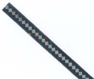
Figure 1 : lightning diverter strip

Near an antenna (radar, radio frequencies ...), set-up of a standard metallic lightning protection system may create troubles due to its metallic frame which may disturb the field emitted or received by the antenna. In most of the cases, this disturbance is negligible if the lightning protection systems is far enough from the antenna. It is not always the case for some radar antennas with narrow angle detection for which the sole presence of the down-conductor (which becomes even more obvious if the conductor is supported by a mast or a pole) brings enough disturbance to prevent the user to install lightning protection means. But experience shows very clearly that lightning impact to radar exists and are creating significant damages. So a solution was needed.